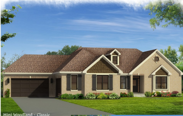
Mini Woodland - Classic