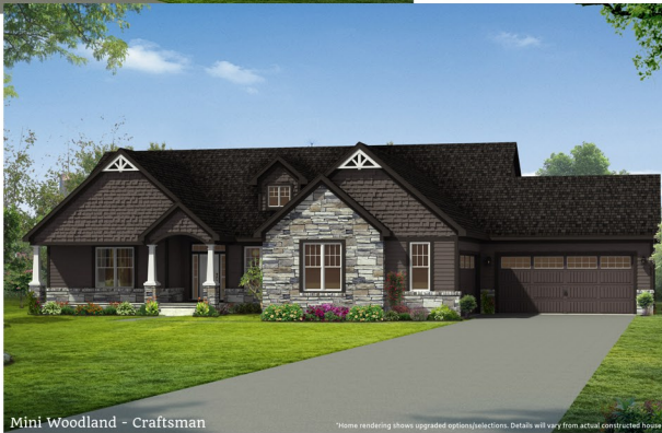
Mini Woodland - Craftsman

*Home rendering shows upgraded options/selections. Details will vary from actual constructed house.